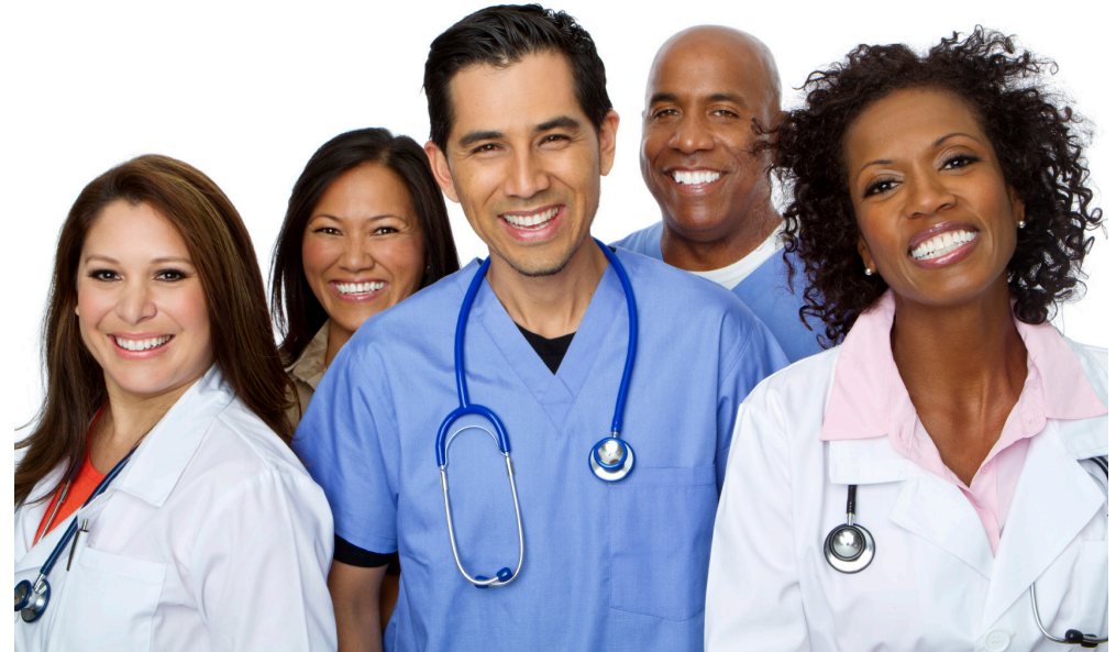
2013 Connecticut RN Workforce Survey Registered Nurse by Age (n = 1661)